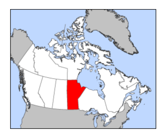
Figure 1. The province of Manitoba, the subject of this study, highlighted in red<sup>16</sup> Contempory Struggles around Metis Identity

Metis identification is a very important and essential debate. Some estimate that more than two million Canadians are eligible to claim Metis status.<sup>17</sup> The social, economic and political effect of that number of newly identified Metis people would be astounding and gives weight to this discussion.