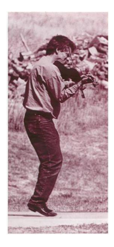
Figure 5. Lawrence Houle, a famous Metis fiddler, dances a jig while fiddling81

Dance is not the only way that the Metis incorporate percussion in their fiddling. Lynn Whidden believes that Metis fiddling can also be compared to Native drumming. She describes how Metis fiddlers "choke up on the bow" to create a very percussive sound. This is a very significant, if sometimes subtle, distinction between folk and Metis fiddling, especially considering the importance of the drum in Native and Metis cultures. Another reason that stylistic differences, like the percussive and rhythmic nature of the bowing, have developed is because the fiddle was originally a solo Metis instrument that needed to accompany itself. In folk music, the fiddle was often accompanied by other instruments, like the banjo,