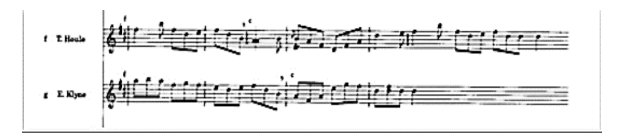
Figure 6. A transcription of the last phrase of Haste to the Wedding, transcribed by Anne Lederman.<sup>92</sup>

Although the music traditions of Europe and North America are vastly different, they do share some characteristics that have allowed them to blend. Anne Lederman lists several of these similarities including texture, rhythm, melodic embellishment, pitch set, and contour. One of the similarities that it is easiest to see is the texture. As Lederman says, both traditions consist of melody with percussive accompaniment. One voice accompanied by percussion is very important in Native music traditions. Because the fiddle is a very melodic instrument, the transition was relatively easy, and the fiddle eventually became a complete substitute for the voice in some situations.