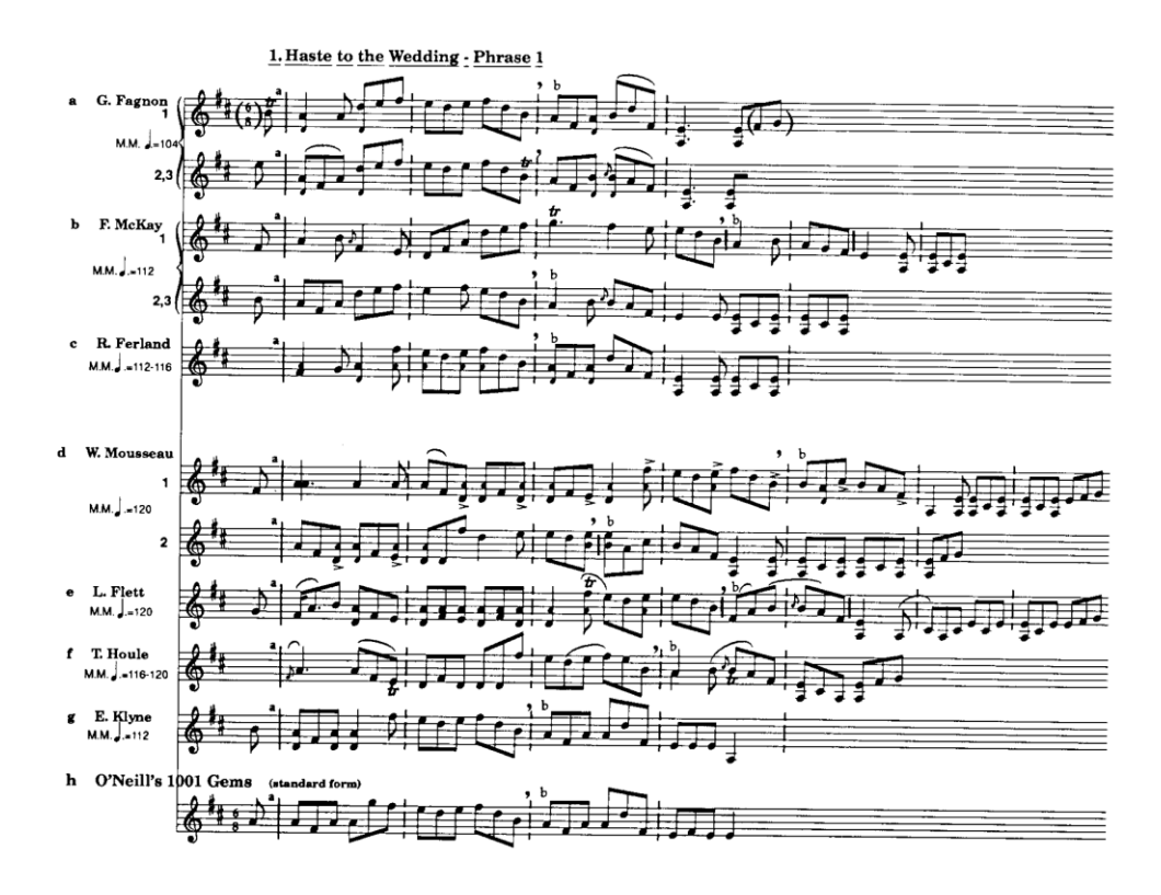
Figure 2. The first phrase of Haste to the Wedding , recorded by eight different fiddlers in order from oldest to younges, as transcribed by Anne Lederman<sup>66</sup> Recordings have affected oral and aural traditions

eleven Metis fiddlers in order from oldest at the top to youngest at the bottom. The vast variations between versions is almost bewildering to us, with each version almost unrecognizable, even in length, but it is a common practice among traditional Metis fiddlers. Melodic, rhythmic, and length of phrase variation are not out of bounds for the Metis fiddler.